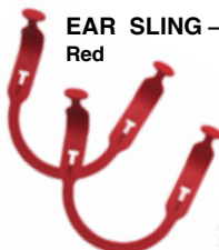
EAR SLING – Red