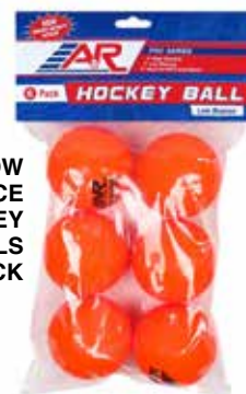
LOW BOUNCE HOCKEY BALLS 6-PACK