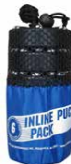
INLINE PUCK IN MESH BAG – 6-PACK