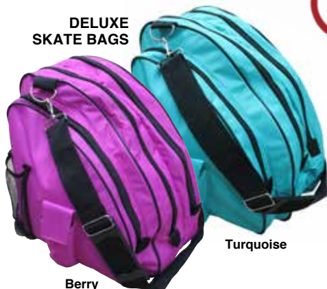
DELUXE SKATE BAGS