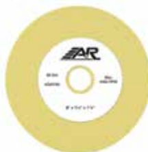
GWY80 GRINDING WHEEL