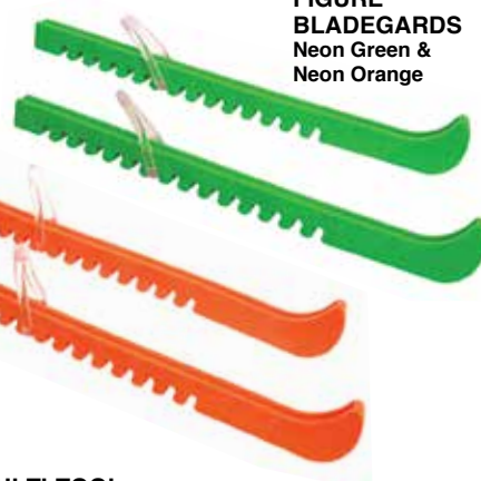
FIGURE BLADEGUARDS Neon Green & Neon Orange