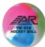
TIE-DYE HOCKEY BALL