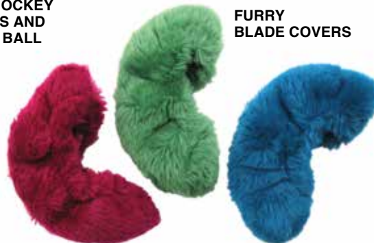
FURRY BLADE COVERS