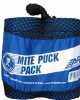
MITE PUCK IN MESH BAG – 12-PACK