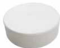
WHITE HOCKEY PUCK