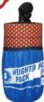
TRAINING PUCK IN MESH BAG – 6-PACK