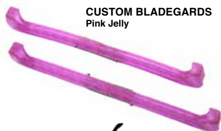
CUSTOM BLADEGUARDS Pink Jelly