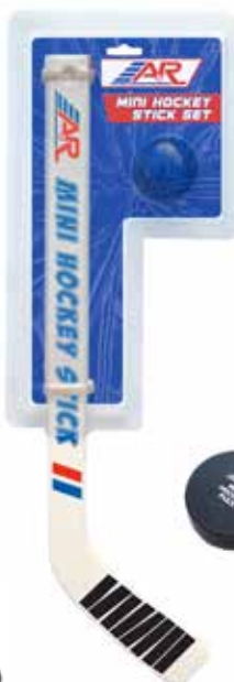
MINI HOCKEY STICKS AND FOAM BALL