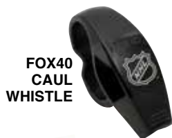
FOX40 CAUL WHISTLE