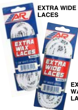
EXTRA WIDE LACES