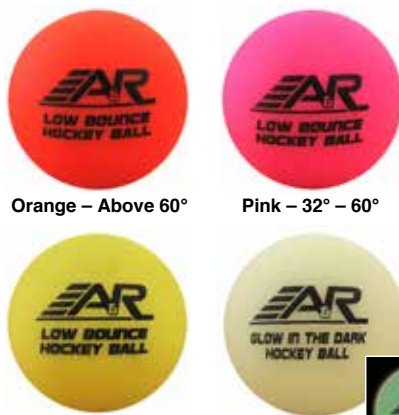
Orange – Above 60°